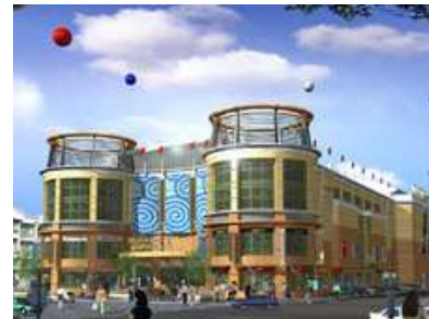
GOLDEN CITY SHOPPING CENTER PHNOM PENH