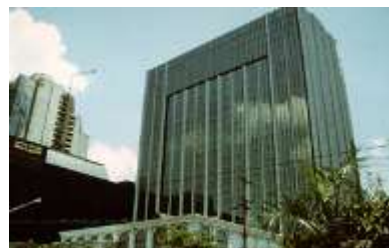
SIAM CITY HOTEL - M.E. -