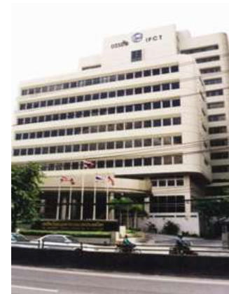
IFCT BUILDING - M.E. -

M = Mechanical E = Electrical P = Plumbing