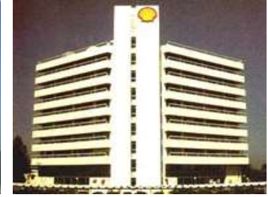
SHELL HEAD OFFICE - M -