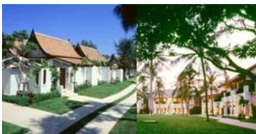
SALA-SAMUI RESORTS - M.E.P. -