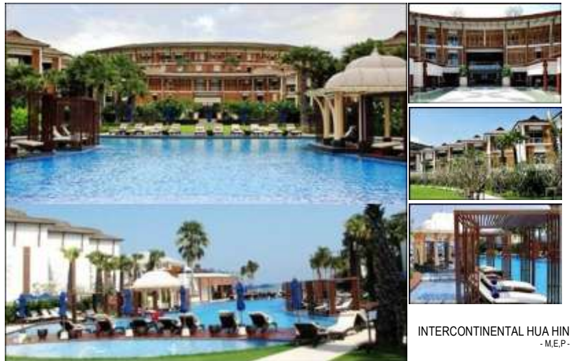
INTERCONTINENTAL HUA HIN - M.E.P. -