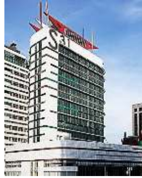
S31 HOTEL - M.E.P. -