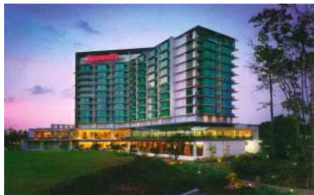
MARIOTT RAYONG M,E,P

M = Mechanical E = Electrical P = Plumbing