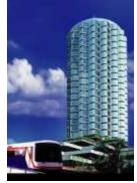
MERCURE AMBASSADOR HOTEL (Renovation) - M.E.P. -