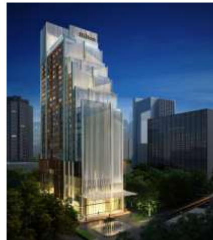
HILTON SUKHUMVIT BANGKOK M,E,P