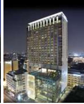
LE MERIDIEN BANGKOK - M.E.P. -