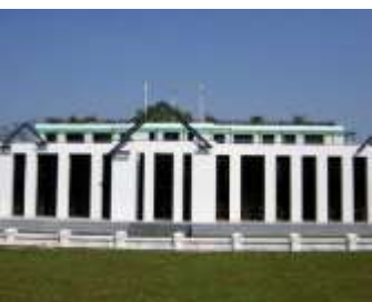
PRIVY COUNCIL OFFICE - M,E,P -