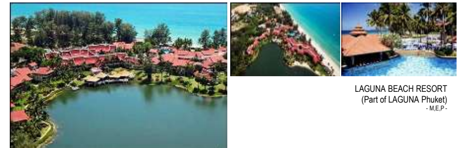
LAGUNA BEACH RESORT (Part of LAGUNA Phuket) - M.E.P. -

M = Mechanical E = Electrical P = Plumbing