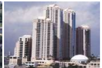
THE PRESIDENT PARK - M.E. -

M = Mechanical E = Electrical P = Plumbing