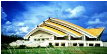
AUDITORIUM Khon Khaen University - M.E -