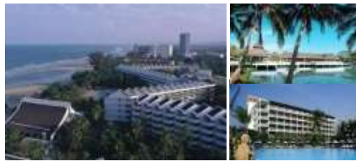
HOLIDAY INN REGENT BEACH CHA-AM (Renovation) - M.E.P. -