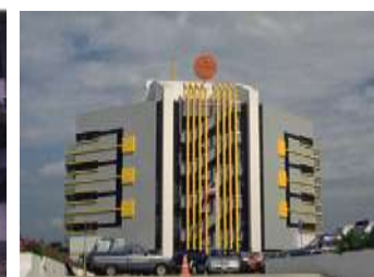
METROPOLITAN ELECTRICITY AUTHORITY, BANGKHAEN - M -