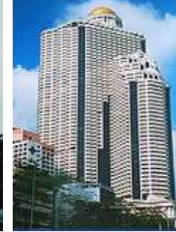
ROYAL CHAROENKRUNG - M.E. -