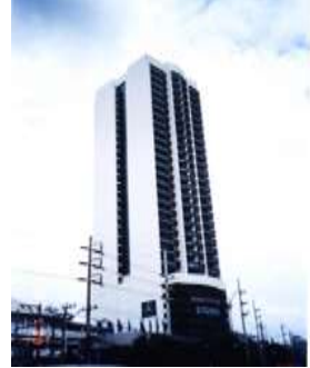
LUMPINI PARK VIEW - M.E.P. -