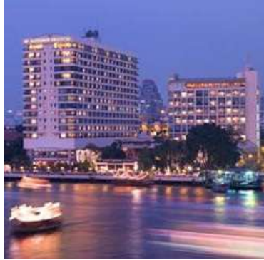
MANDARIN ORIENTAL The Renovation Back of House, Main Lobby