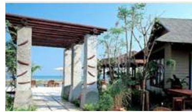
FISHERMAN'S VILLAGE - E. -