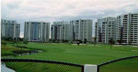
PARKLAND PHASE II - M.E.P -