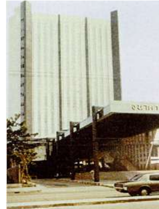
KRUNGTHAI BANK (Head Quarter) - M.E. -