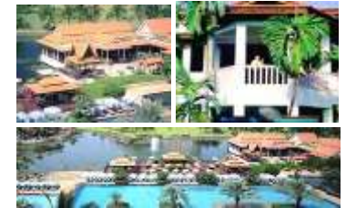
DUSIT AND RESORT HOTEL - M.E.P. -