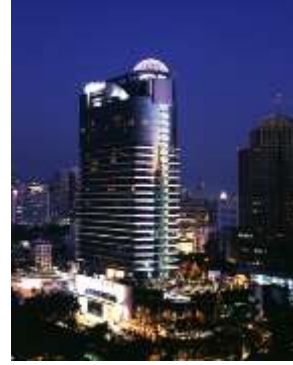
HOTEL PLAZA ATHENEES - M.E.P. -