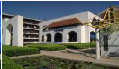
THAMMASAT UNIVERSITY LIBRARY - M -