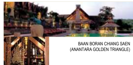
BAAN BORAN CHIANG SAEN (ANANTARA GOLDEN TRIANGLE)

M = Mechanical E = Electrical P = Plumbing